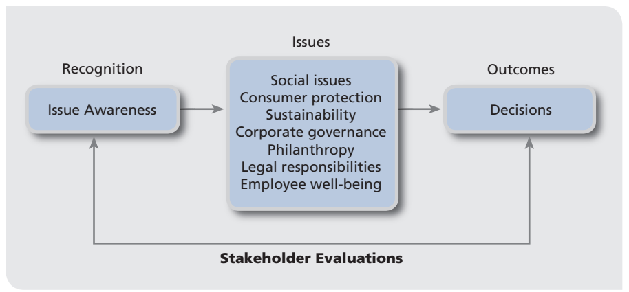
FIGURE 1.1 Major Emphases of Social Responsibility